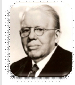
Melvin Jones Founder Lions Club International