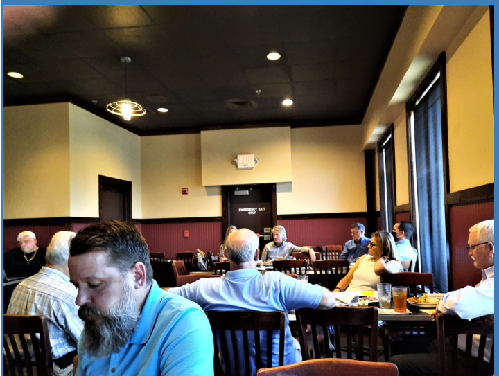
Parks & Charities Board Meeting 7-20-2020

“Be STRONG and COURAGEOUS. Do not be afraid or terrified because of them, for the LORD your God goes with you; he will NEVER leave you nor forsake you.”