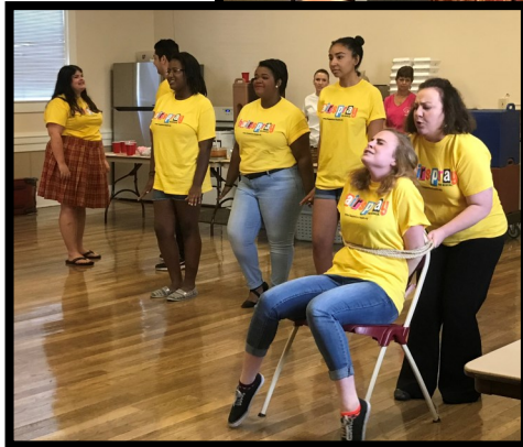
The Cast of Hairspray Performs a Few Numbers for TFLC